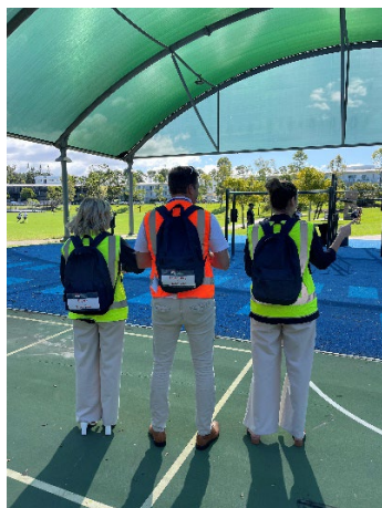
Figure 4 - School Staff while Offsite