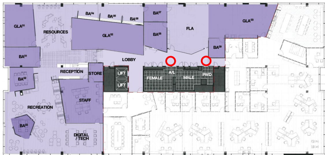
Figure 2: Toilet Supervision Stations